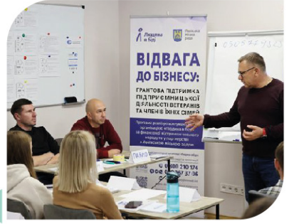
Participation in the programme to support the entrepreneurship of veterans and their families.