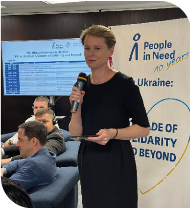
Commemoration of 10 years of PIN Ukraine.