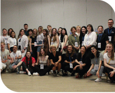
A youth forum where young people could discuss their vision for the future.