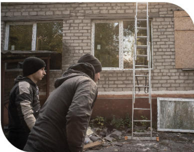
Rehabilitating child hospitals.