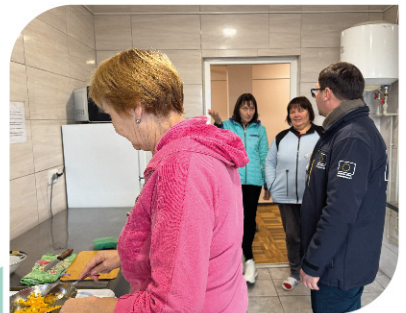
Rehabilitation of collective centres and social institutions and training their staff.