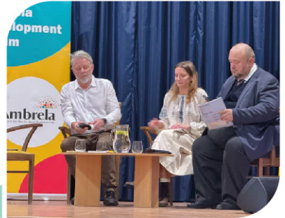
Panel discussion during the Ambrella Forum in Bratislava on Winterisation.